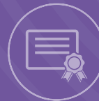
Opportunity to Learn