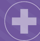
Plus Lots More