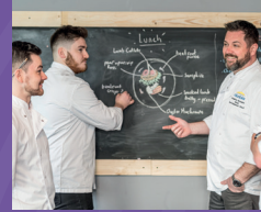
New Product Development