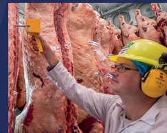
Food Safety & Quality