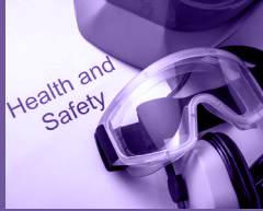
Health & Safety